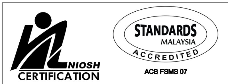
Figure 1: The Symbols with Colour